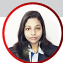
Nishtha Protiviti 7 LPA